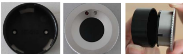
how to install