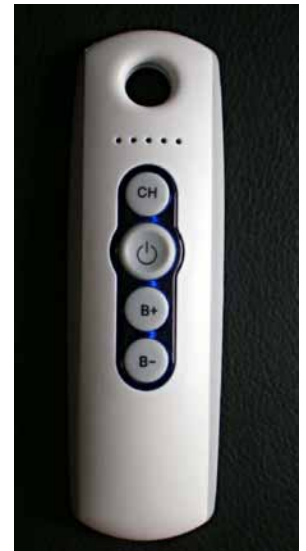
Пульт управления SMART-DIM